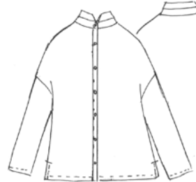
M5017 HL $59